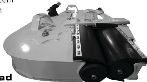
R-5 Magnum Shaker Head